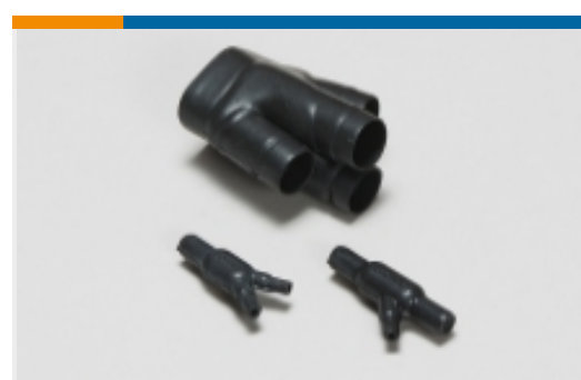
Cable Transitions & Breakouts(3)