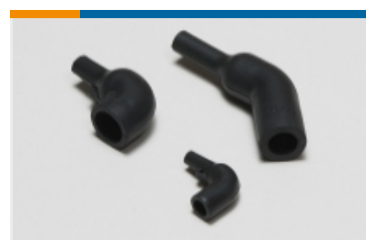
Heat Shrink Boots(2)